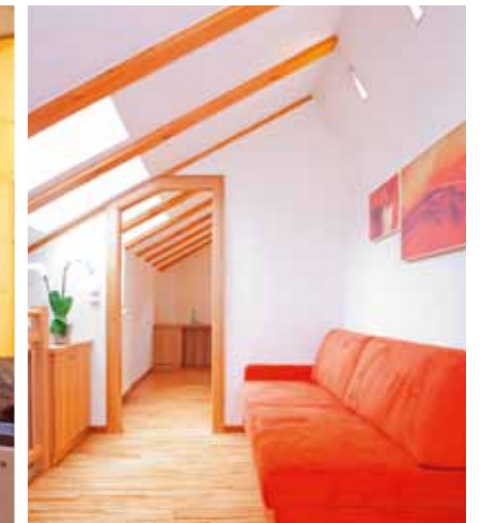
Impressions ... Anticipation ... Yearning ...